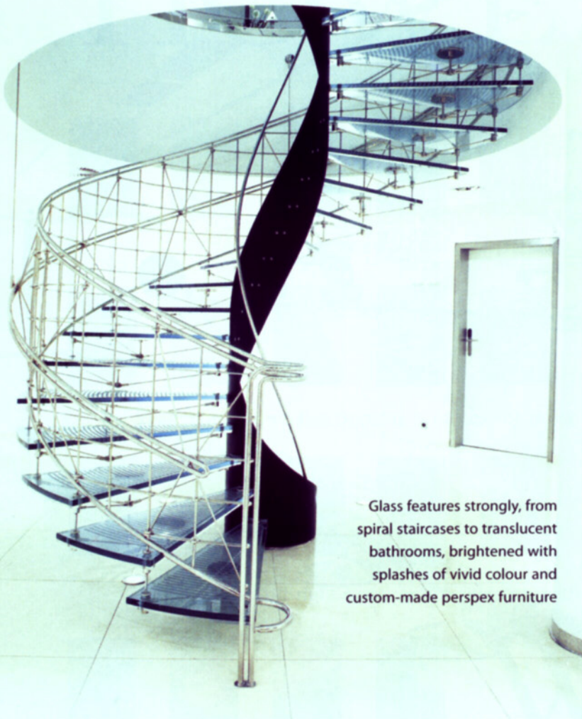
Glass features strongly, from spiral staircases to translucent bathrooms, brightened with splashes of vivid colour and custom-made perspex furniture